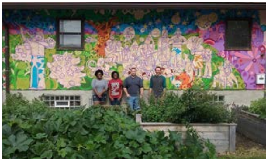
Circle of the Beloved

St. John’s Episcopal Church in St. Cloud partners with the St. Cloud Commission for Homeless Men